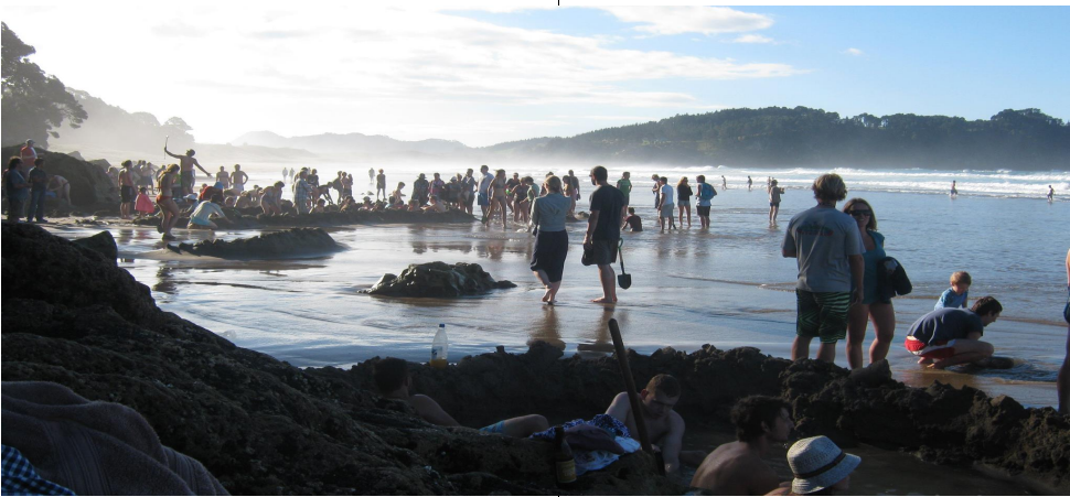
Hot Water Beach, Coromandel

Given most of our outdoors activities occurs on public conservation land it is fitting to check what is going on out there.