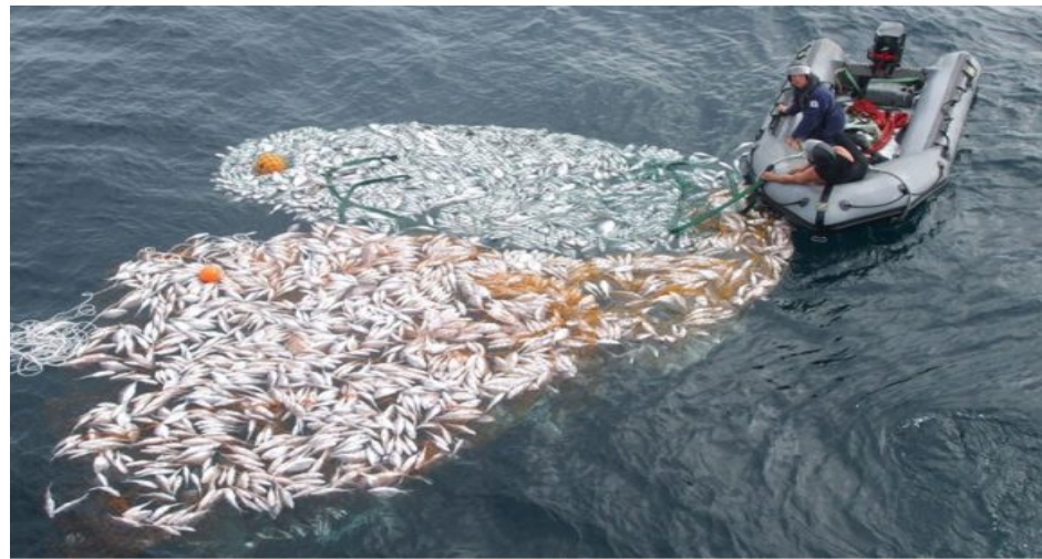
Illegal Fish Dumping Recovery

The New Zealand Sport Fishing Council (NZSFC) has set out the policies required to restore New Zealand's inshore fisheries to abundant levels and return the marine environment to a more productive ecosystem. This is in reaction to loss of public confidence in way our fisheries are being managed. The ongoing reports of wasteful practices, widespread dumping and high grading all point to a system with poor oversight and a Ministry captured by the very people it is charged with administering.