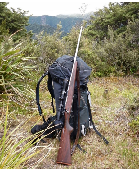
Pack and rifle: icons of our culture

The impact of this court decision will be a reminder to DoC that adequate and meaningful consultation with recreational hunters is a statutory obligation and not merely a formality.