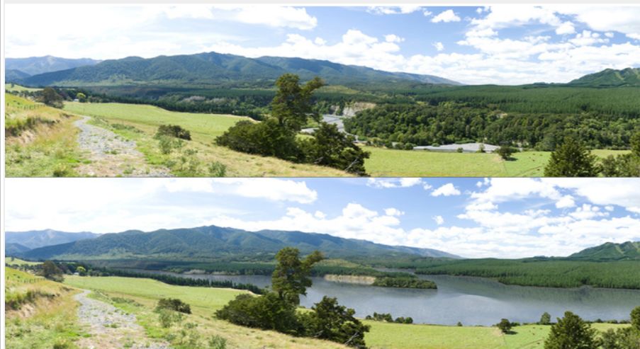
The proposed Ruataniwha dam scheme

Conservationists welcomed the Supreme Court decision which ruled illegal the swapping of Ruahine Forest Park Conservation Land to enable the Ruataniwha Dam construction in Hawkes Bay and congratulated Forest & Bird on a successful outcome.